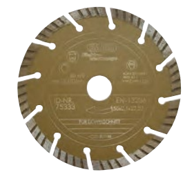
Diamond cutting blade

BDN 511 close to the wall: the new suction cover allows easy working close to the wall. This system makes it possible to work bridgeless directly beside the wall.