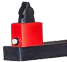
Stepless joystick control