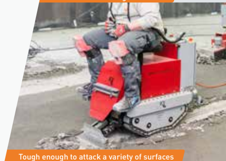
Tough enough to attack a variety of surfaces